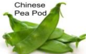
Chinese Pea Pod