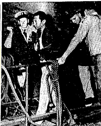
SURVIVOR OF SHIP SINKING —Exhausted after his ordeal in water following sinking of Navy Hospital ship Benevolence, this unidentified survivor still is able to walk off the Army cot that rescued him and brought him back to San Francisco.

This week's increase was the second since the outbreak of the Korean war. As a result of the move, officials said, the cotton will have about 23 per cent more sugar available during the last half of 1950 than was marketed during the first six months.