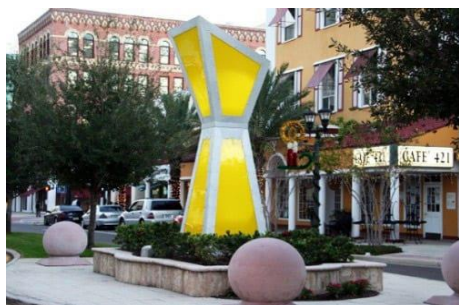
Figure 2. This 15-foot-tall solar powered piece resides in Clearwater, Florida and is a part of the city's Sculpture360 program.