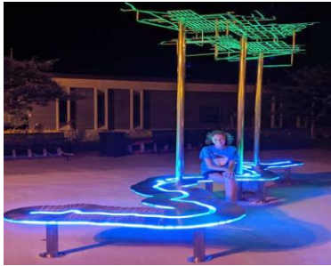
Figure 4. Solar sculpture in downtown Webster City in Iowa. The public art piece incorporates dynamic elements powered by solar energy. The sculpture was designed to reflect Webster's City's history and identity.