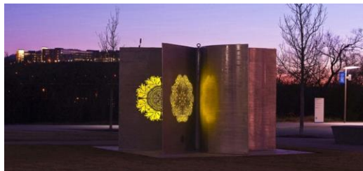
Figure 1. Located at Xavier University in New Orleans, LA, this beautiful and intricate solar powered sculpture lies at the middle of campus. Its combination of industrial materials with delicate nature-inspired laser carvings shows a unique perspective on a link between technology and the natural world. The intention of the design was to replicate a seedpod coming out of a dormant state to form new life.