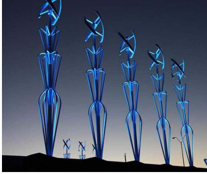
Figure 3. This installation can be found just outside El Paso airport in Texas. It consists of an array of 16 15ft vertical wind turbines. Each is lit from below with LED lights. The lights can even be programmed to celebrate the seasons or other events in the area.