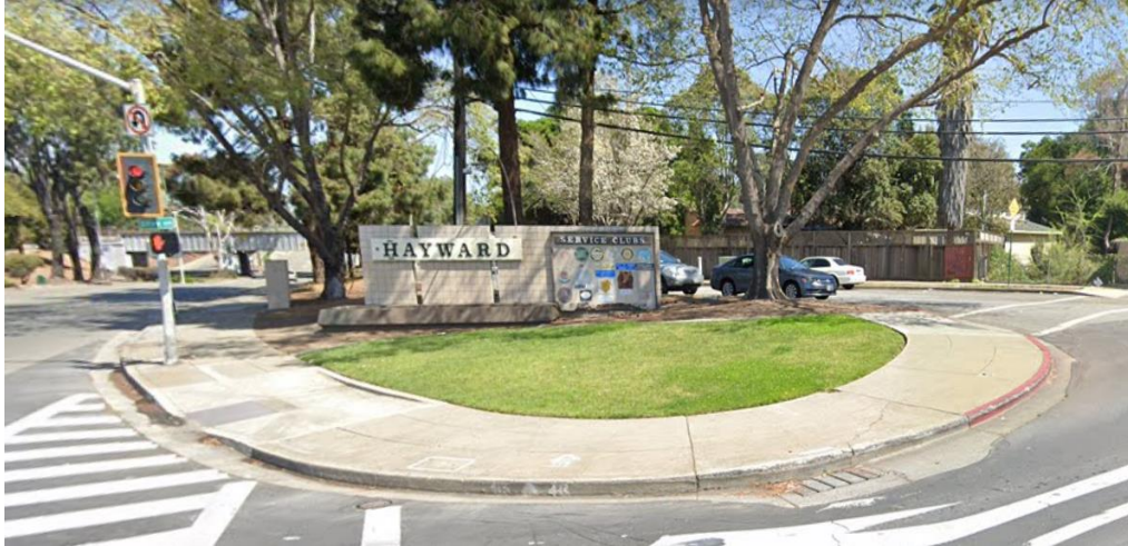
Figure 1. Existing Hayward Gateway sign on Jackson St. and Silva Ave.