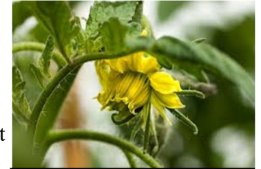
Most tomato plants are self-pollinating

Wet seed: seed grows in the wet pulp of some vegetables. Example: pumpkin.