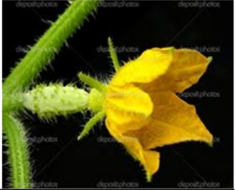
Bloom of a cucumber plant

Biennial: plant that grows the first year, and in the second year blooms, makes seeds and dies.