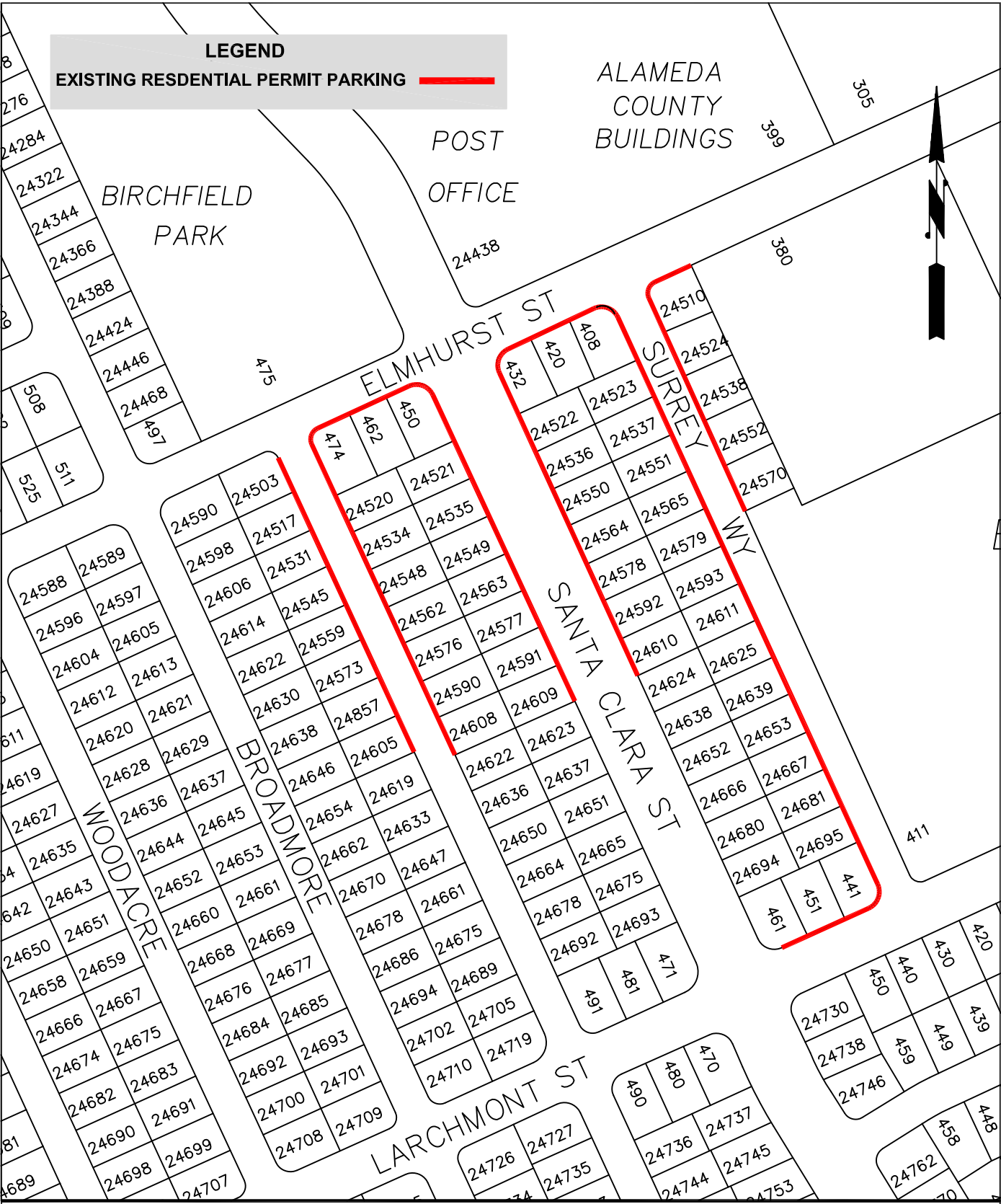
Existing Perferential Permit Parking Area Santa Clara Neighborhood