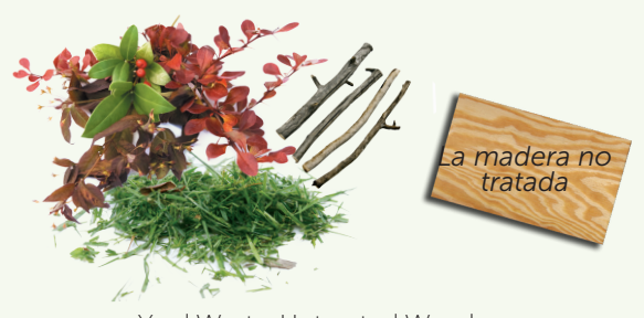
Yard Waste, Untreated Wood