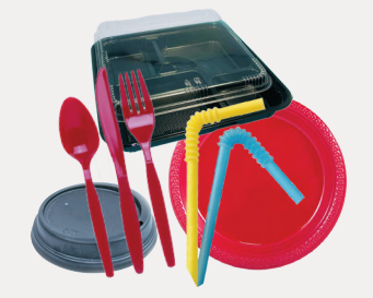
And To-Go Containers