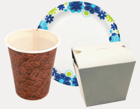
Disposable Drink Cups, Plastic Lined/Coated Plates And To-Go- Containers (With Surface Sheen)