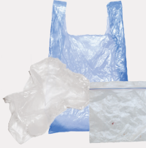
Plastic Wrap, Bags & Other Plastic Film