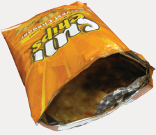
Snack & Chip Bags, Candy Wrappers