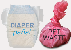
Desechos de mascotas