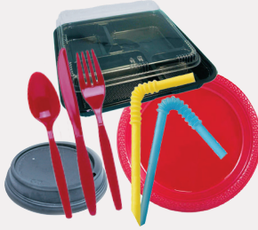
Plastic Utensils, Straws, Cup Lids And To-Go Containers