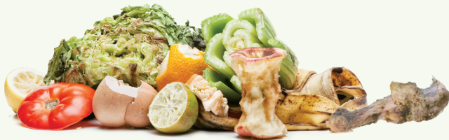
Food Scraps, Including Egg Shells, Meat & Bones