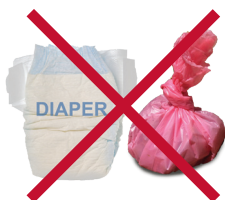
Pet Waste Desechos de mascotas