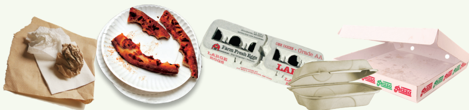
Food Soiled Paper, Napkins, Paper Towels, Pizza Boxes, Cardboard Egg Cartons, Non-coated Take-out Containers & Paper Plates (No surface sheen)