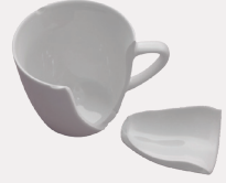
Broken Glass & Dishes