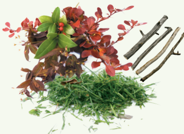
Yard Waste, Untreated Wood