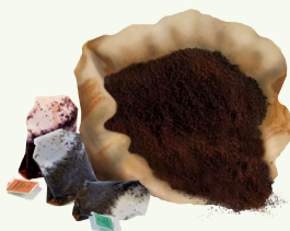
Coffee Grounds & Tea Bags