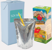
Drink & Beverage Cartons, Boxes / Pouches (Multi-Material Packaging)