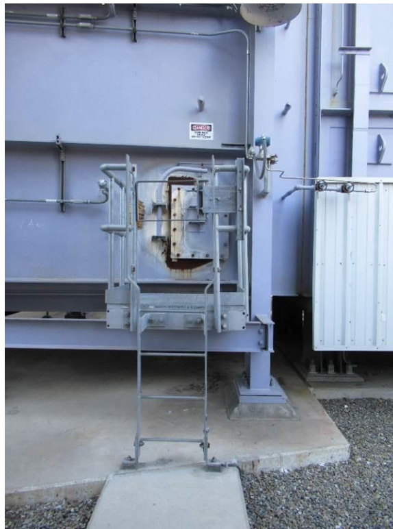
Figure 1: Manway hatch is severely corroded and presents a burn risk for workers.

“Station activities are effectively managed so plant status and configuration are maintained to support safe, reliable and efficient operation.”