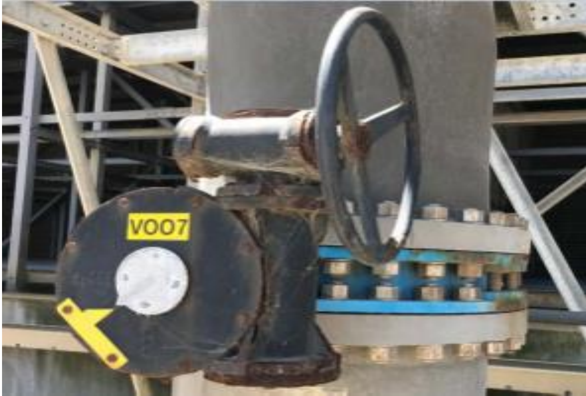
Figure 7. Corroded riser butterfly valve at the cooling tower.