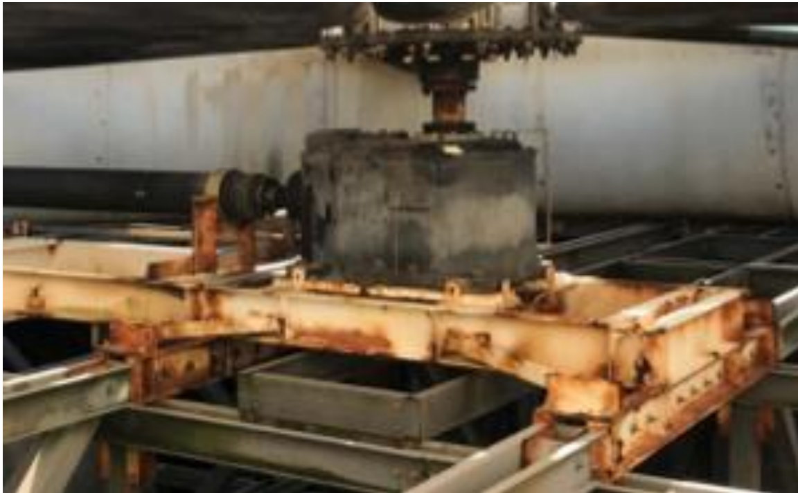
Figure 8. Corroded support braces.