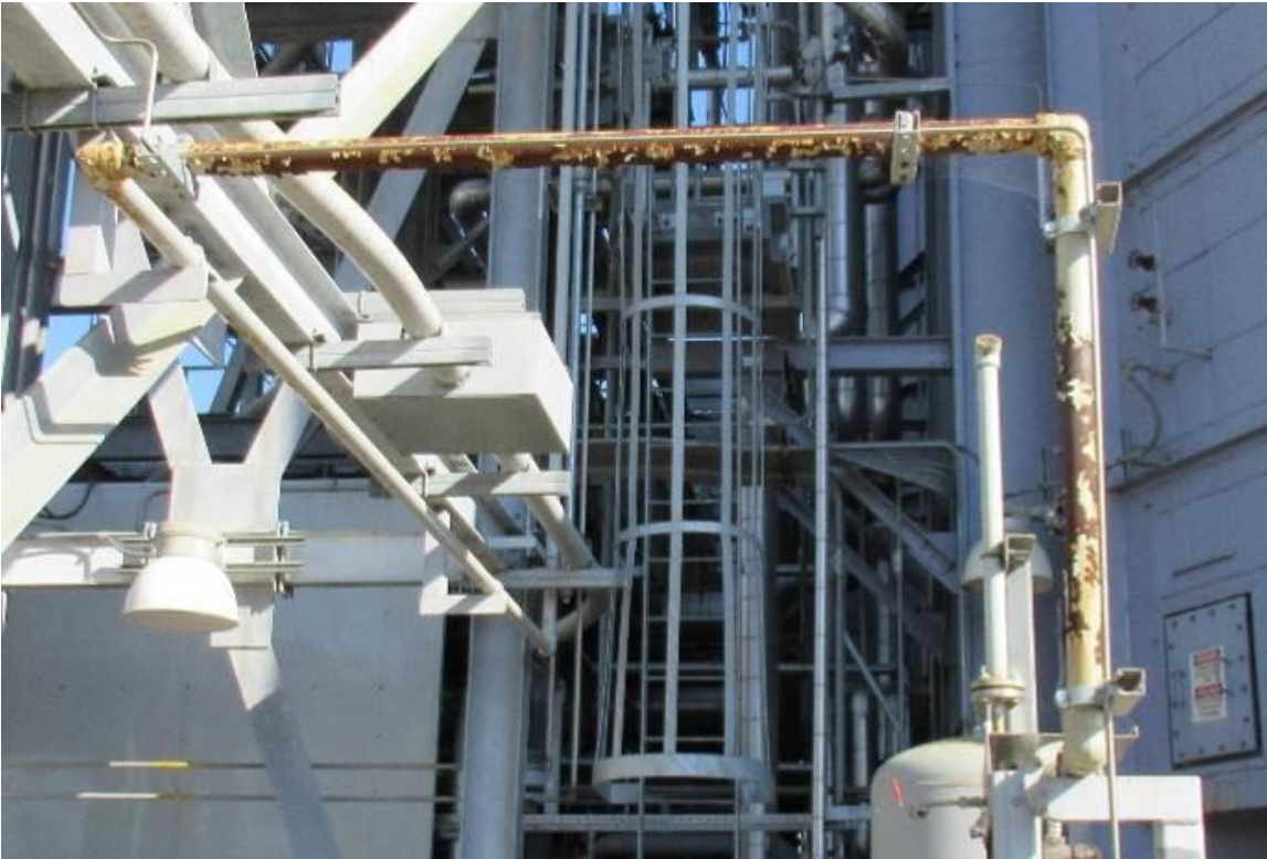
Figure 6. Corroded piping.