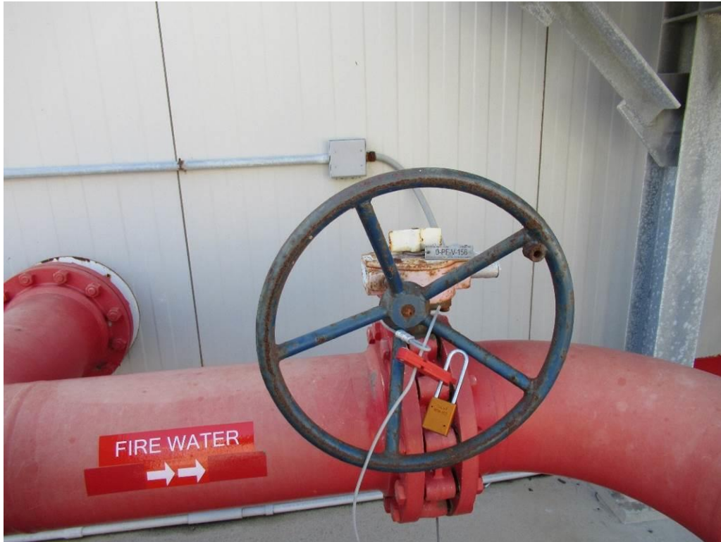
Figure 10: Tamper switches at two control valves outside the fire pump house are defective.

Finding 8: The Plant does not conduct regular emergency drills. Russell City has not conducted an emergency drill in its five-year operating history until recently. Further, the Plant has no procedure, either via a recurring Work Order or in its Emergency Action Plan, that would require the Plant to conduct regular emergency drills. Drill provides an opportunity to rehearse anticipated emergency scenarios. Through the exercise, the Plant can validate the adequacy of its emergency response activities and equipment. The Plant must conduct annual emergency drills in accordance with best industry practice. Because Russell City has bulk storage of ammonia and other hazardous chemicals, ESRB also recommends that the Plant involve external agencies, such as the Hayward Fire Department and Hazmat Team, in its emergency drills to the extent practical and reasonable.