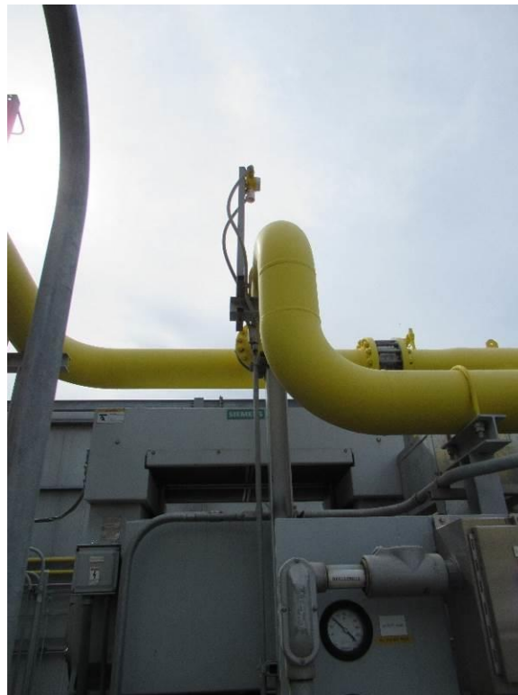
Figure 2: Methane detectors at the gas compressors are defective.

“Maintenance is conducted in an effective and efficient manner so equipment performance and materiel condition effectively support reliable plant operation.”