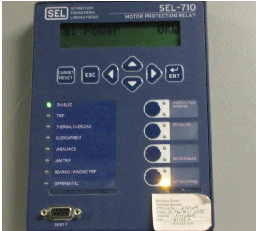
Figure 12: Calibration stickers are not kept up-to-date.