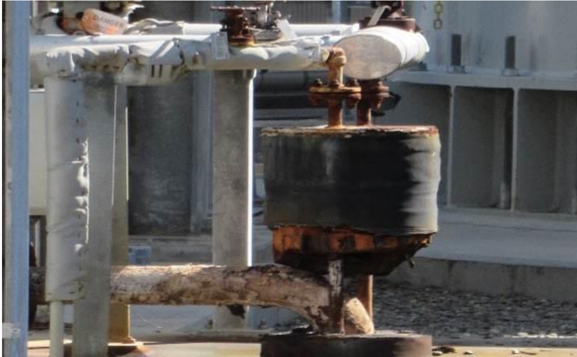
Figure 9. Corroded equipment at the ZLD.

Finding 6: Minor leakage at a Y-strainer connection. ESRB observed leakage of feedwater at a Y-strainer isolation valve connection. This occurred in the LP suction of Unit 2’s BFP (directly above the pump). The strainer basket filters the water to catch any debris from entering and damaging the feed pump. There was a work order issued for this defect (WO #27404412 – Priority 3), which called for the replacement of the flange gaskets from paper to Flexitallic® spiral wound gaskets that are more resilient to pressure and temperature fluctuations and suitable for this application. While onsite, the Plant retightened the flange connection and was able to temporarily stop the leak. However, the joint will likely leak again the next time the unit goes through a startup cycle. The Plant must replace joint gaskets and all necessary hardware to permanently repair the leak. While ESRB did not observe similar leakage on Unit 1, it recommends the Plant to inspect and assess similar mechanical fittings throughout the plant to identify and prioritize changeout of gaskets where appropriate.