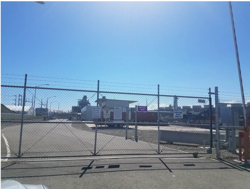
Figure 14: Missing NFPA Placard on main gate.

“The GAO values and fosters an environment of continuous improvement and timely and effective problem resolution.”