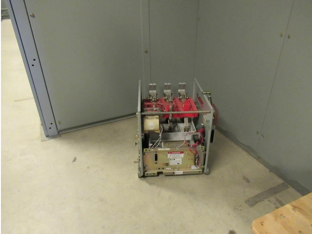
Figure 15: Improper storage of spare component.