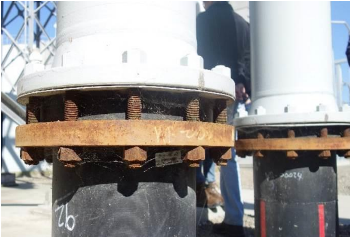
Figure 4. Corroded pipe flange.

GO 167, Maintenance Standard 9: Conduct of Maintenance states: “Maintenance is conducted in an effective and efficient manner so equipment performance and material condition effectively support reliable plant operation.”