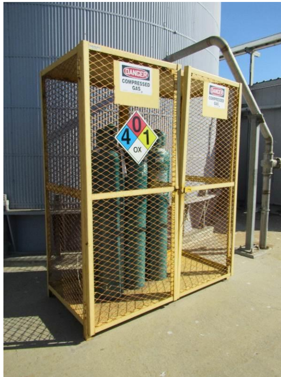
Figure 11: Compressed gas cylinders are not being secured properly.

“The GAO values and fosters an environment of continuous improvement and timely and effective problem resolution.”