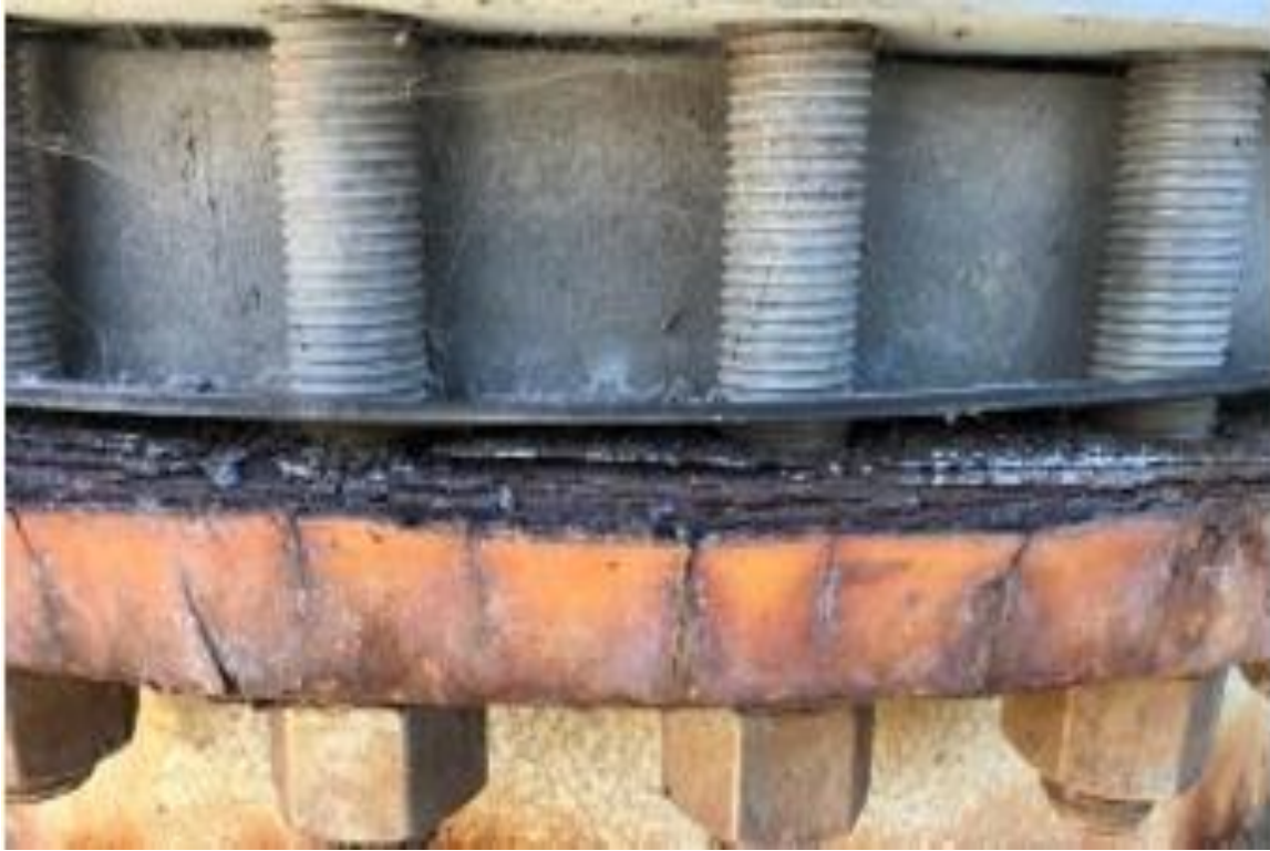
Figure 5. Corroded pipe flange.