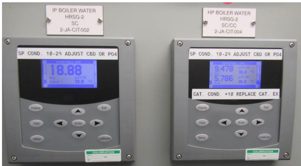
Figure 13: Calibration stickers are not kept up-to-date.

Finding 12: Missing NFPA Placard on main gate. ESRB observed that the Plant’s main gate did not have a National Fire Protection Association (NFPA) 704 warning placard. The Plant