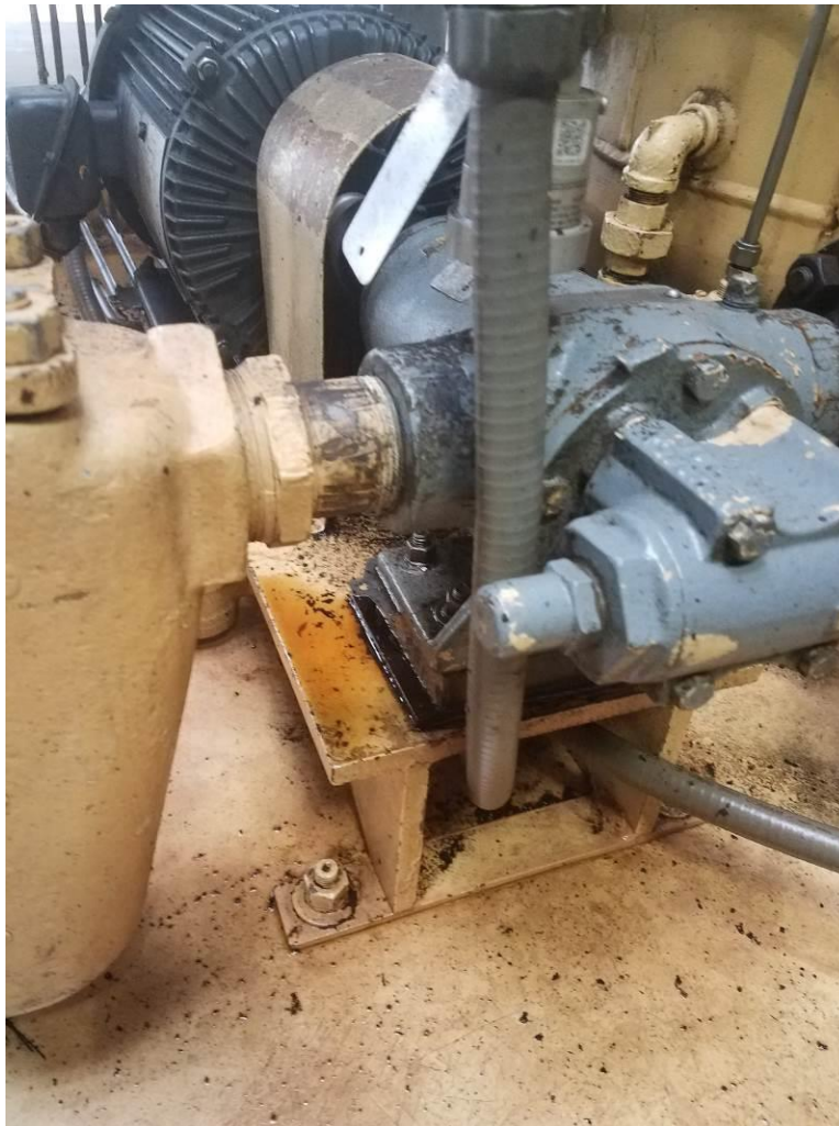
Figure 3: Oil leaks at the steam turbine lube oil pump skid.

“Station activities are effectively managed so plant status and configuration are maintained to support safe, reliable and efficient operation.”