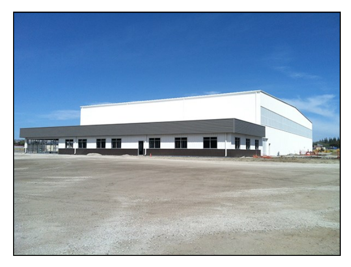
Meridian Hayward: The current focus is framing the office area and construction of the entrance road. Completion is scheduled for September 2016.