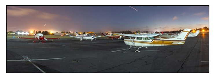
begins, but please ensure that you check the current airfield NOTAMs and Airport Advisories as much of this work is weather dependent.

The City of Hayward will be undertaking several large airfield projects this summer. At the time of publication the airport has received a grant offer from Caltrans and we're anticipating final FAA funding for the rehabilitation of Runway 28L/10R. This project requires a seven day runway closure, but we are working with the contractor to reduce paving time as much as possible. A night closure of seven nights will also be required thirty days after paving for grooving work. We will be holding one more informational meeting before the project