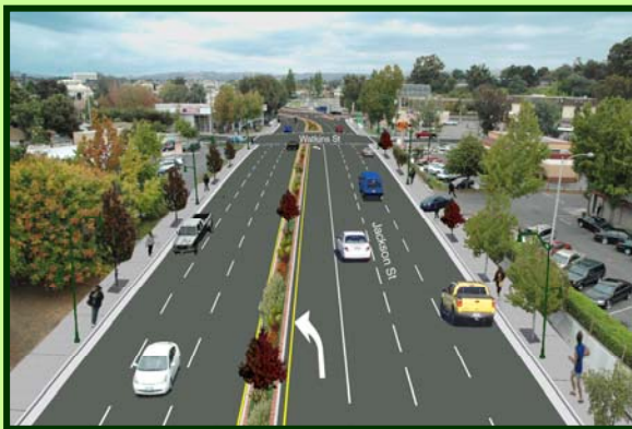
◀ Jackson Street looking east

The Route 238 Corridor Improvement Project includes a number of features that are designed to relieve traffic congestion and improve traffic flow in the corridor. The project limits are from Foothill Boulevard at the City limits in the north to Mission Boulevard/Industrial Parkway in the south. The major project component is a mini-loop concept, which consists of one-way traffic on Foothill Boulevard, A Street, and Mission Boulevard in the downtown area only. The project also provides significant improvements for pedestrians and bicyclists. Foothill Boulevard will include 14-foot sidewalks as well as a bike lane on the east side of Foothill. During peak hours, Foothill Boulevard will include four lanes in each direction north of City Center Drive by converting the parking lane into a travel lane. New sidewalks will also be constructed along Foothill Boulevard and Mission Boulevard. South of Mission-Foothill-Jackson, the major improvement will be a spot widening at Mission-Carlos Bee that will provide better access to California State University. Access improvements will also be constructed at Mission-Berry and at Mission Boulevard at the Moreau High School Driveway. The project included in the FEIR eliminates the grade separations at Mission-Foothill-Jackson and at Jackson-Watkins as well as most of the peak-hour parking restrictions on Mission Boulevard.