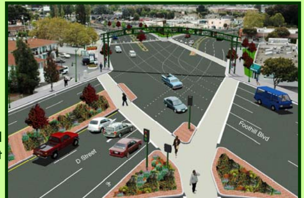
D/Foothill looking west ▶