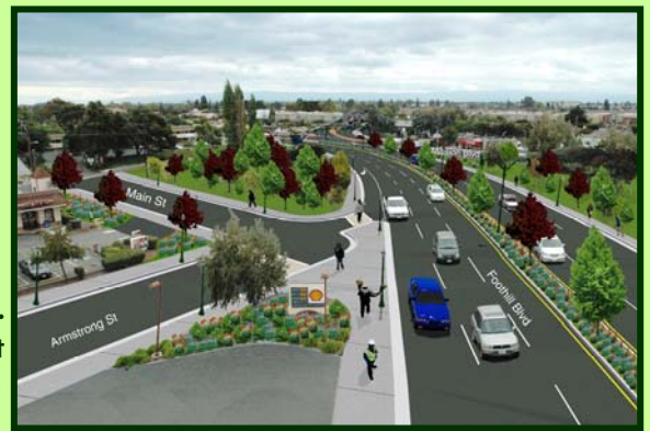
Foothill Blvd. looking west ▶