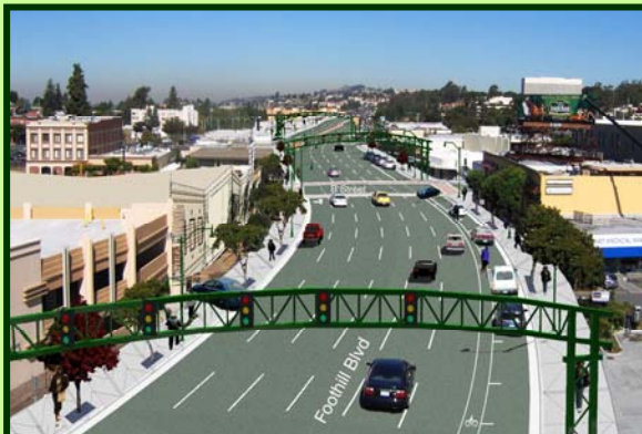
◀ Foothill Blvd. looking north