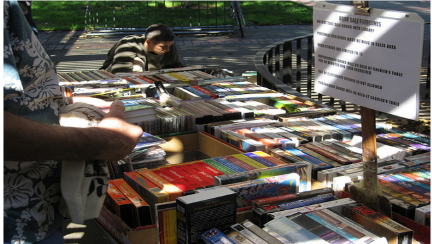
Friends of the Library book sale

The library offers a wealth of opportunities for people to volunteer to make our society a better place. We need people who have a variety of skills, who want to help people, who want to devote their energy to something important, who want to connect with people. We all know the financial crisis has affected all levels of society, including the library. Library services are crucial, especially in times of economic downturn. Many people depend on us for their literacy, for help for their children's education, for a place to meet and interact. We need the help of the community and our friends to keep all the programs at the library productive and successful. We need volunteers in a range of programs. I will touch on