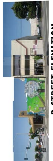
B STREET ELEVATION