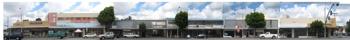
FOOTHILL BLVD. ELEVATION