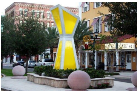
Figure 2. This 15-foot-tall solar powered piece resides in Clearwater, Florida and is a part of the city's Sculpture360 program.