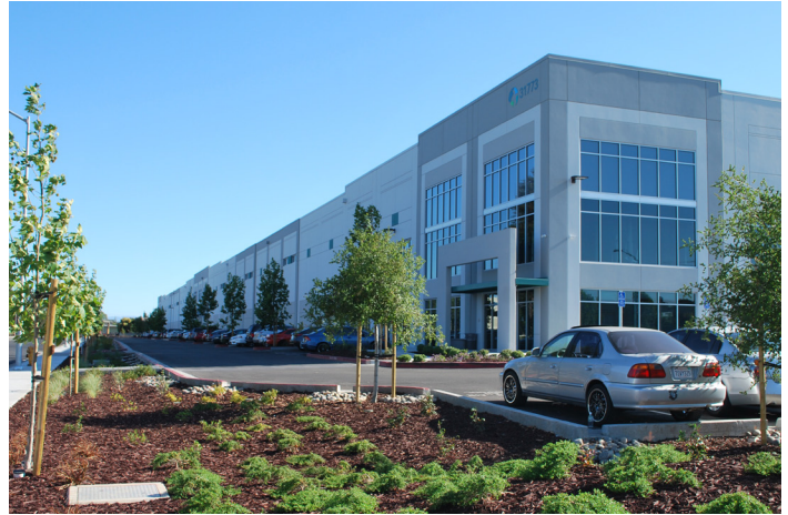
Street facing building elevation includes variation in wall plane, wall height, and roofs at different levels.