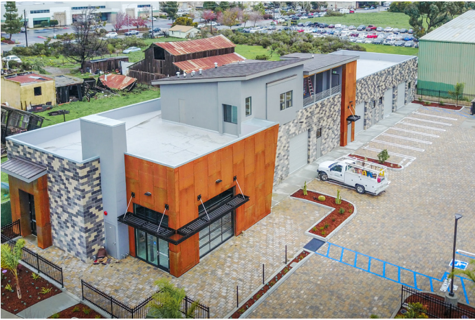
Unique paving at driveway highlights site entry while building is oriented to allow for daylighting of interior work areas.