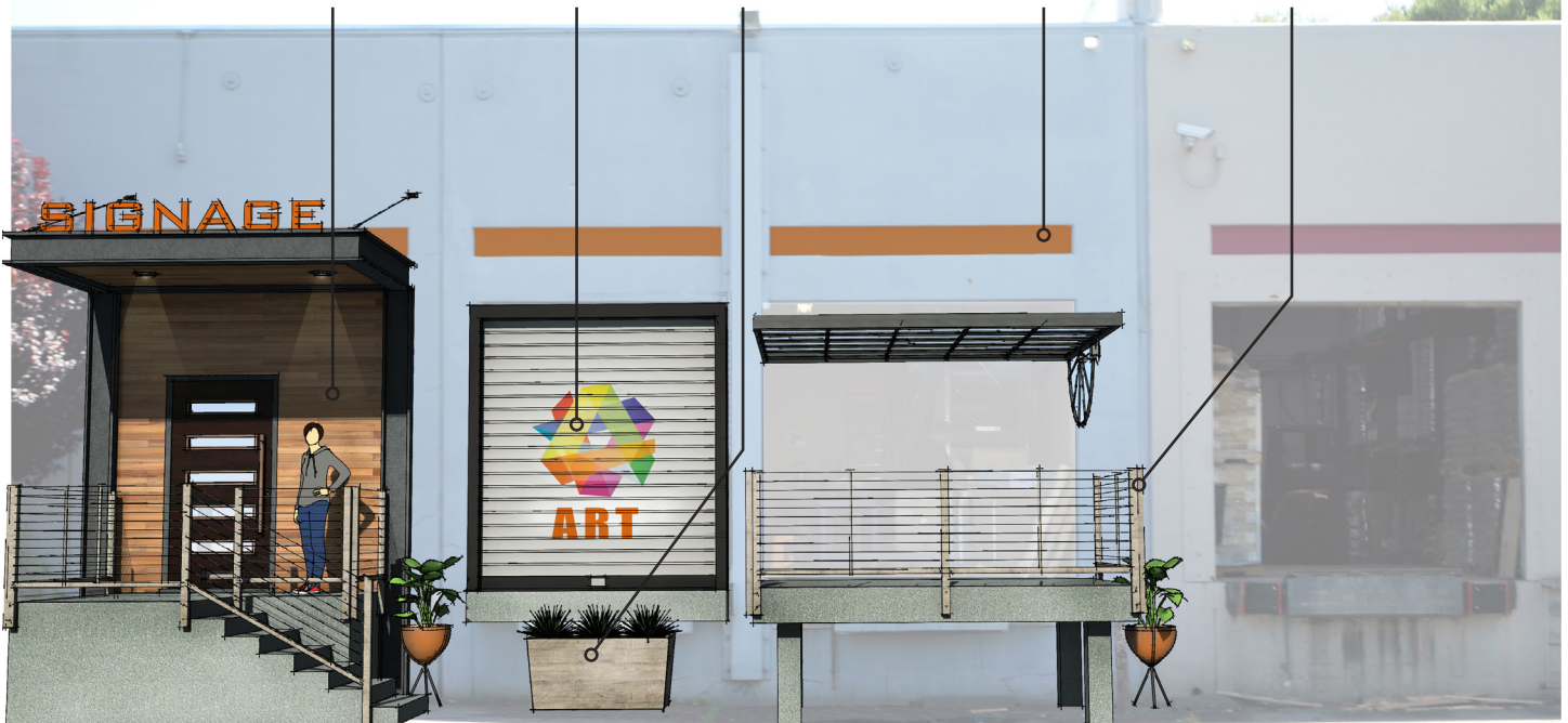
Street facing facade improvements that could occur to create and enhance visual interest.