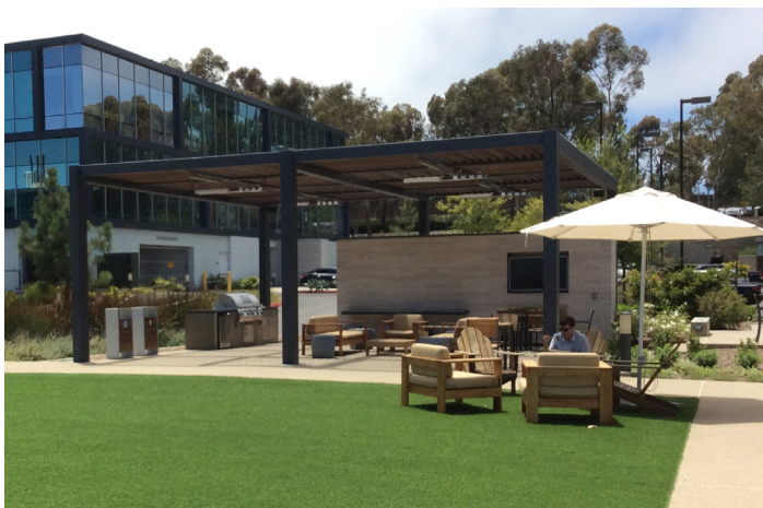
Outdoor employee area located to take advantage of sun access, while providing facilities such as barbecue, recreation areas, and outdoor patio.