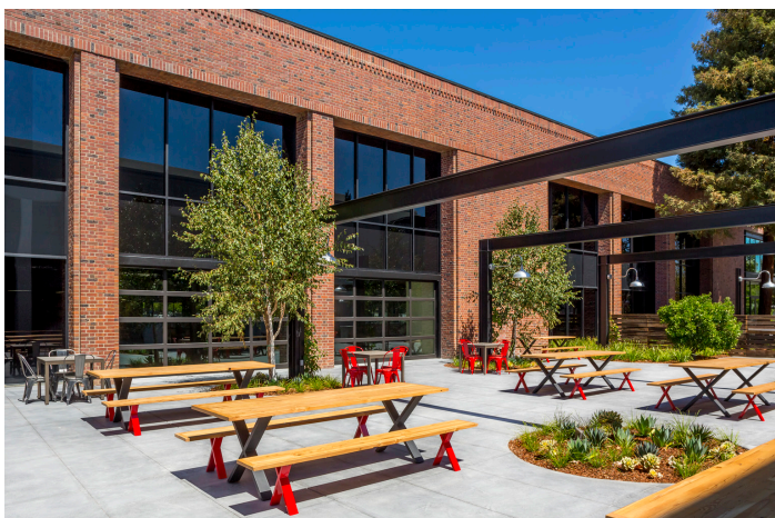
Outdoor eating area located adjacent to indoor break areas and enhanced through use of scored concrete.