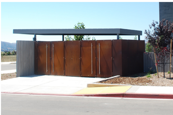
Trash enclosure providing pedestrian entries enhances ease of use.