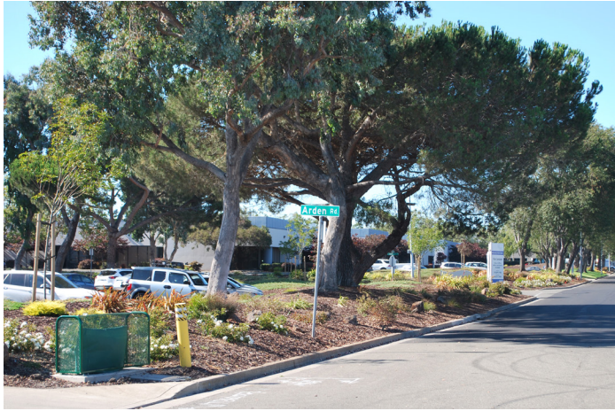
Uniform landscape palette establishes streetscape character and complements adjacent property landscaping along the street.