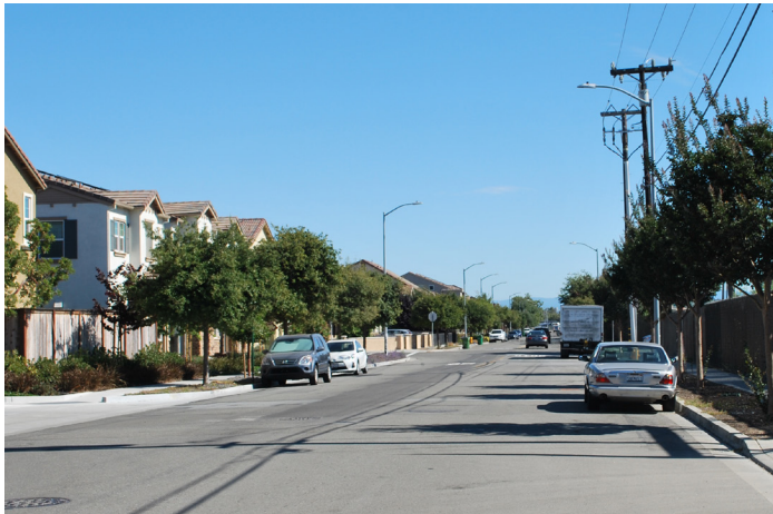
Residential streetscape character (left) is maintained by industrial properties (right) through consistent tree and shrub type and placement.