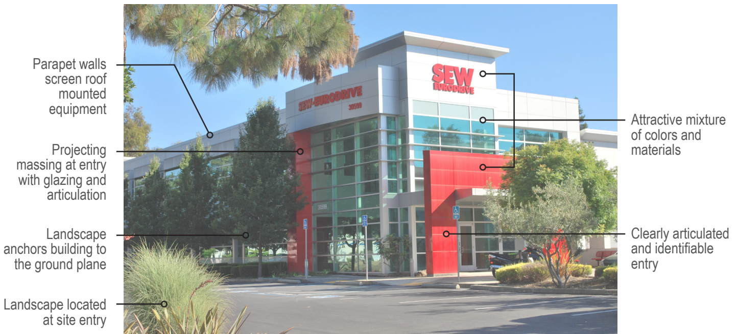
Example of recent industrial development reflecting current design characteristics.

Development in the Industrial District is intended to be characterized by functional, well designed site and building development to improve the economic viability of properties and to enhance the visual character of the Industrial Technology and Innovation Corridor. Important features of development include coordinated landscaping along frontages and adjacent to open spaces, safe and clearly demarcated pedestrian connections, prominent entries with articulation and detailing, loading docks at the side or in the rear, and amenities such as recreational facilities, open space, benches, shelter and other features that enhance the employee experience.