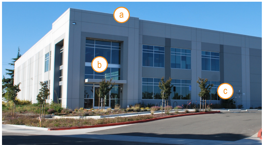
Current massing and articulation of industrial development.