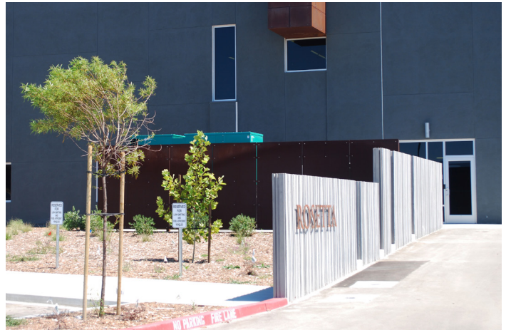
Wall and fencing designed as integral part of a site through continuation of building materials, with landscape minimizing visual monotony.