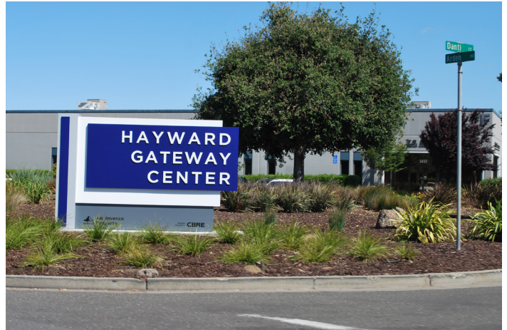
Project signage coordinated with overall colors and materials palette for the project.