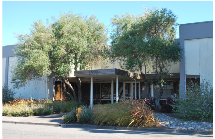
Accent landscaping utilized to create visual interest and highlight primary building entry.