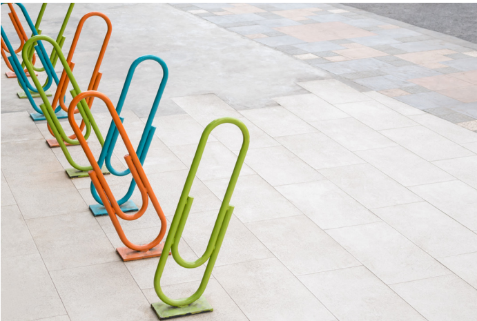
Bicycle rack placed near primary building entry as unique feature that complements adjacent business.