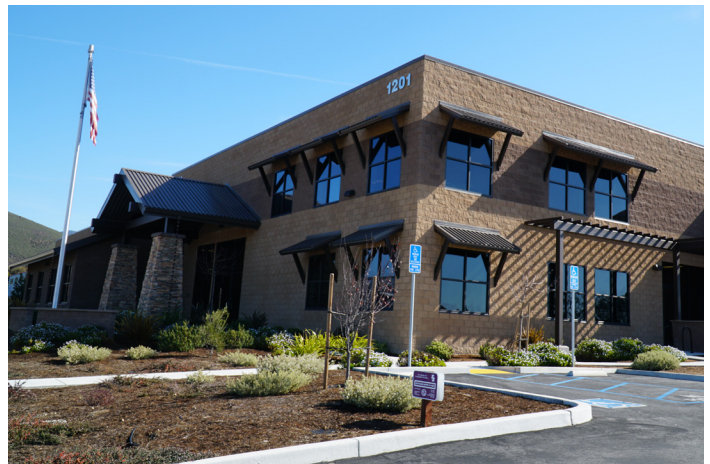
Articulation and detailing continue on side elevation through use of windows, awnings, and other detailing.