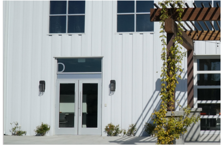
Light fixtures mounted at appropriate height for setting adjacent to building entry and shielded downward.