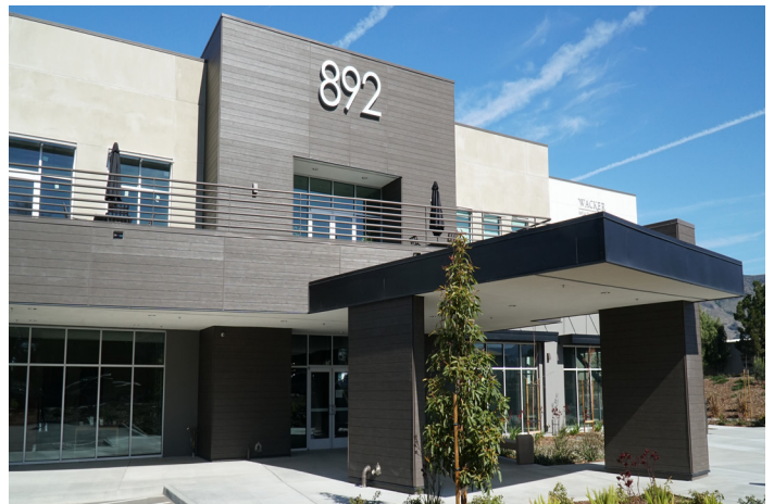
Primary business signage located prominently above building entry to enhance visibility from the street.