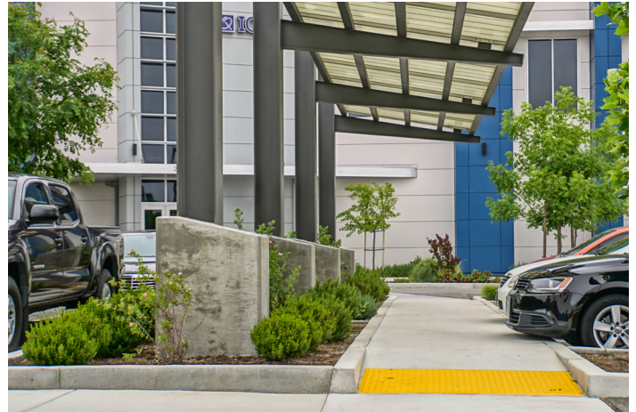
Landscaped islands provide clear pathways to primary building entry while minimizing pedestrian conflicts with vehicles.