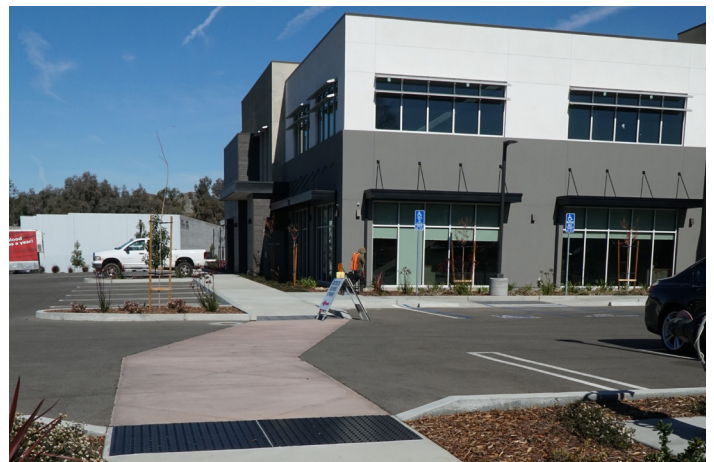
Unique, colored paving clearly identifies pedestrian pathway through parking area.