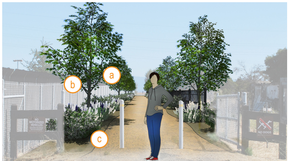
Example landscaping adjacent to open space, trails, or trail access.