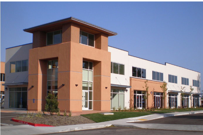
Window proportions complement architectural style and clerestory windows are used to allow interior natural daylighting.