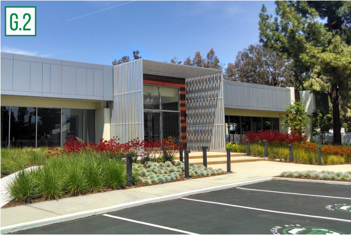
Changes in height and massing provide variation and articulation. Vertical building elements break up what may otherwise be horizontal architectural composition.