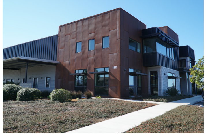
Pedestrian pathways are easily identifiable and connect the building to parking areas and off-site sidewalks.