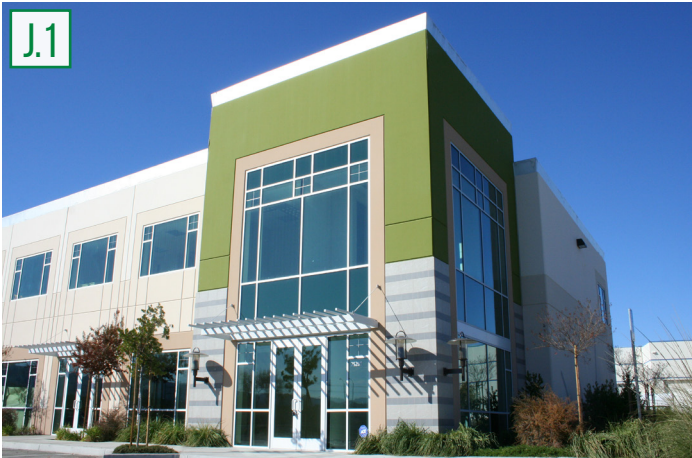
Colors, materials, trim, windows, awning, and doors provide clear identification of building entry and reinforce building design.