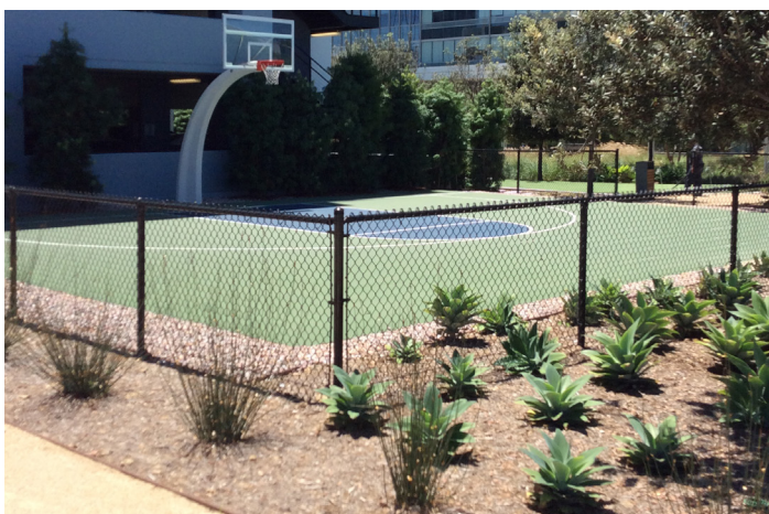
Half court basketball for games between employees on breaks.