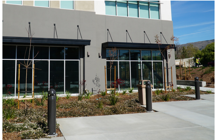
Low, bollard light fixtures placed to provide lighting within pedestrian areas.