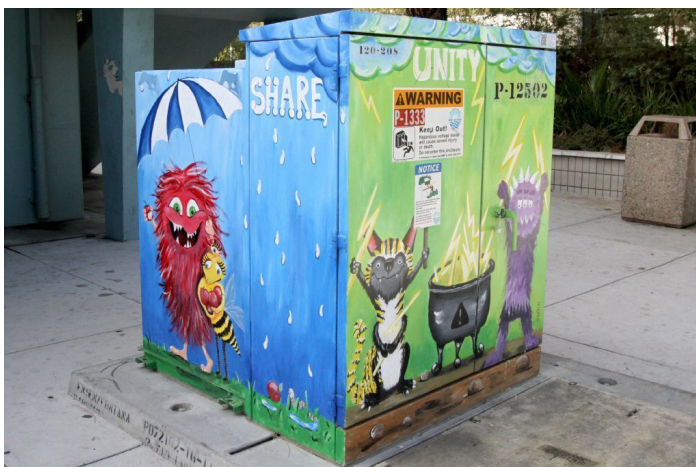
Utility equipment unable to be screened has been enhanced through an art mural.